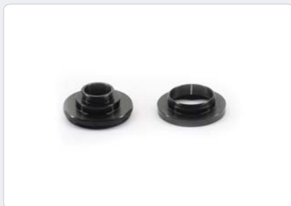
NVS Cam/Video Adapter