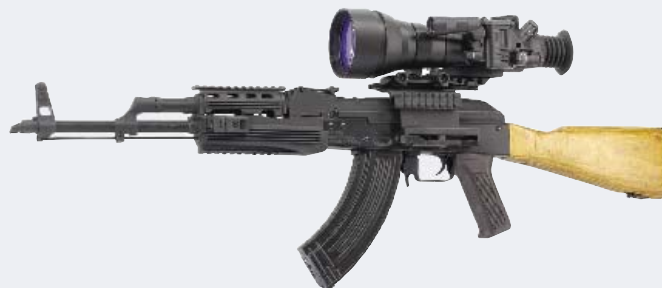
Mounted on AK Rifle using Side Mount