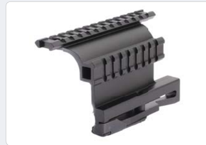
NVS Side Mount