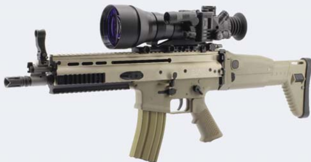
Mounted on Scar Rifle